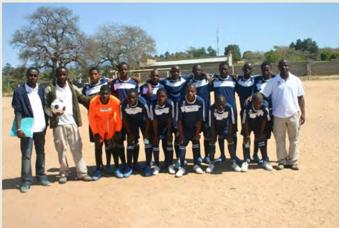
Puledi High School

The overall winners of the netball were: in 1st place Mdluli High School, 2nd place Tladishi High School, 3rd place Moholoholo High School, and 4th place German S Chiloane High Schools. The Mdluli team will also go to the Kruger National Park for a weekend, all expenses paid. After the award ceremony the day finished with a well-earned hot meal