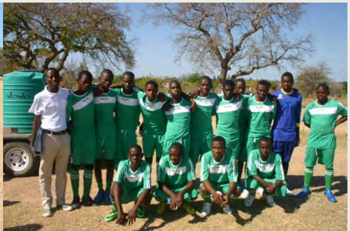
Sokisi High School