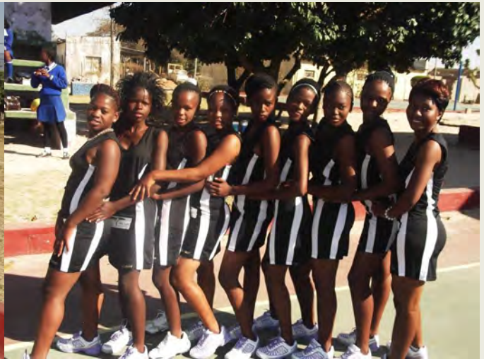
German S Chiloane High School