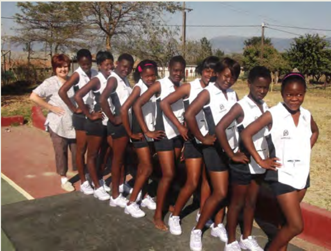
Moholoholo High School