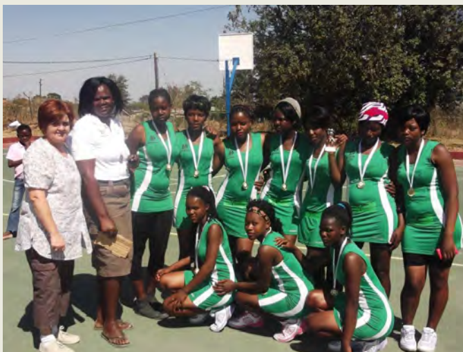
Mdluli High School

A netball and soccer tournament was organised, in which 30 schools played against each other. The four winning soccer teams won full soccer gear and boots, and the best four netball teams netball gear and tackies.