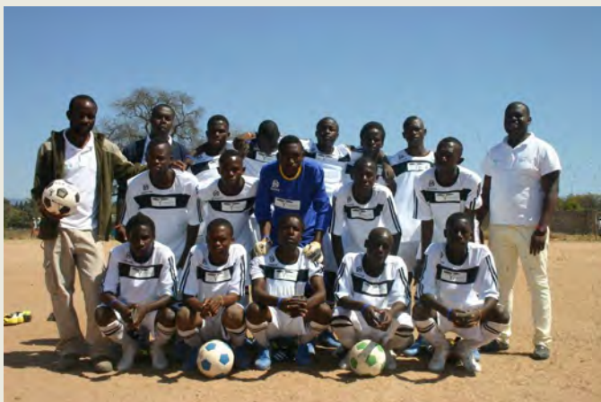
Masingitana High School