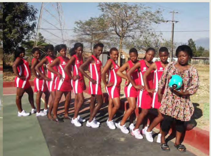
Tladishi High School