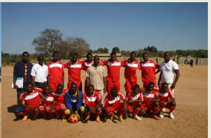
Magwagwaza High School