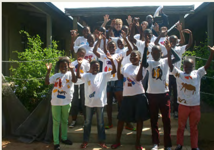
Grade 7s add value to our programme. Learners from Makwetshe Primary School.

Or if you're interested in making any other kind of contribution.