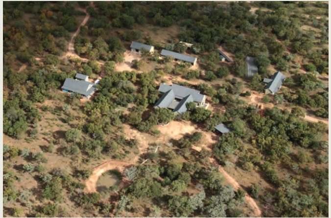
Aerial photo of the Environmental School